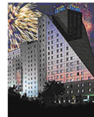
Hotel Estrel Berlin

Sunday, September 18 18:00 – 20:30 h Monday, September 19 9:30 – 20:30 h Tuesday, September 20 8:30 – 18:00 h Wednesday, September 21 8:30 – 18:00 h